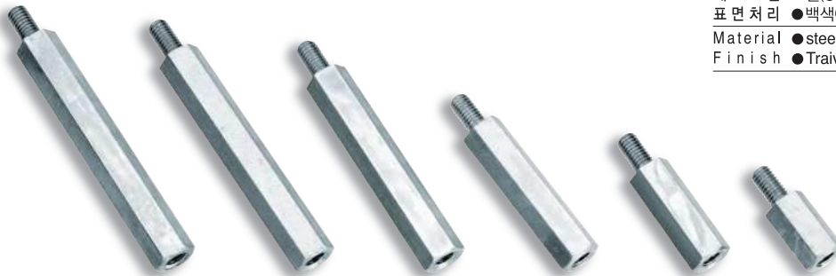
HK-EK-1495Z HK-EK-1490Z HK-EK-1480Z HK-EK-1460Z HK-EK-1440Z HK-EK-1425Z